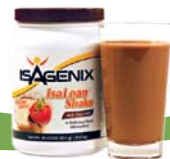
IsaLean® Shake (replaces 1 meal)