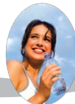
Purified water (8+ glasses per day)