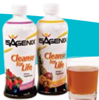
Cleanse for Life™ (4 oz. with purified water 4 times per day)