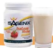
IsaLean® Shake (replaces 1 meal)