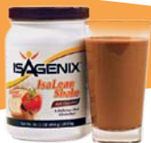
IsaLean® Shake (replaces 1 meal)