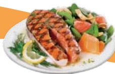
Sensible Meal (400–600 calories)