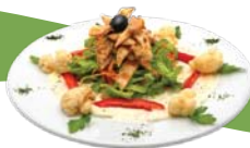
Sensible Meal (400–600 calories)