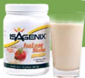
IsaLean® Shake (replaces 1 meal)